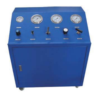
Model A closed type with carbon steel material

For the hydraulic test station(liquid booster station), we have three different cabinet design for choosing