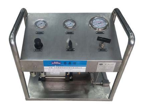
Model C frame type with stainless steel material

DLS Liquid (hydraulic) booster system = booster pump+ following valves, gages, and parts