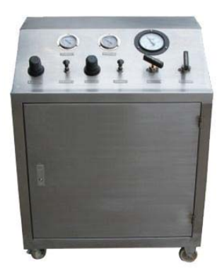
Model B closed type with stainless steel material