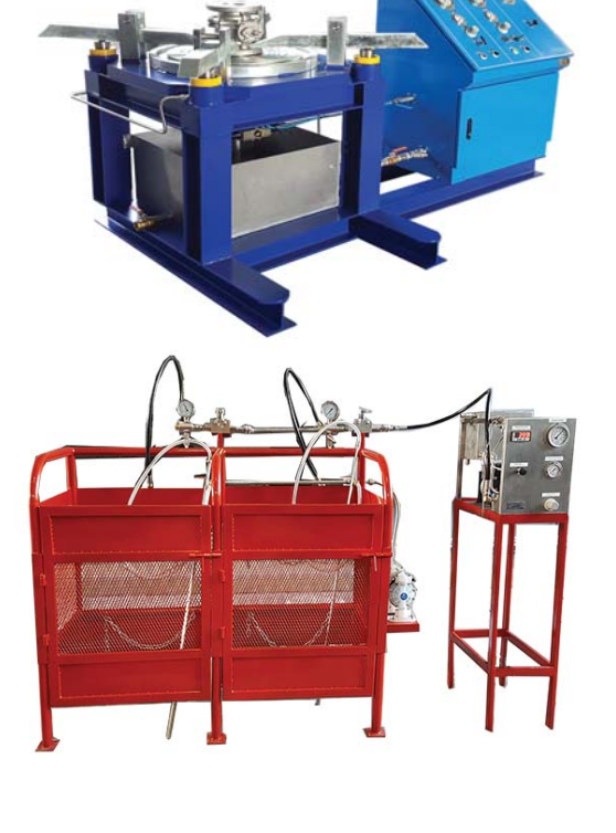
Valve Test Bench, Cylinder Hydrostatic Testing